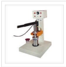
Heat Sealing Machines