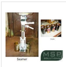
Tin Can Seamer Ropp Cap