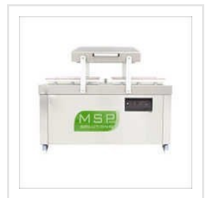
Double Chamber Vacuum Packing