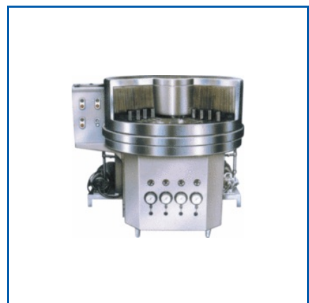
ROTARY BOTTLE WASHING MACHINE