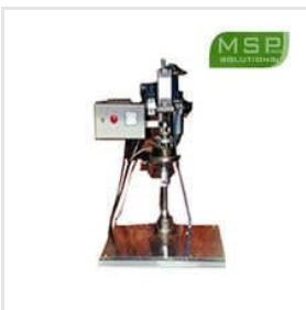
Bottle Sealing Machine