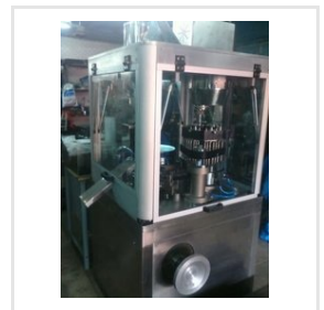
Capsule Filling Machine