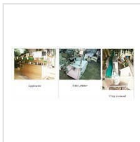
Front Back Labeling Machine