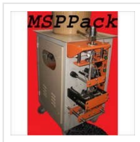
Pepsi Sealing Cutting Machine