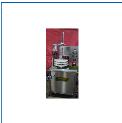
LITCHI JUICE FILLING AND SEALING MACHINE

2 Head Stand Up Pouch Packing Machine, 2 head standy pouch packing machine, 20 Litre Jar Filling Machine, 6 Head Volumetric Filling Machine, Adhesive Filler Paste Filler Machine, Aluminium Lug Capping Machine, Auger Filler powder filling machine, Auger Powder Pouch Filling Sealing Machine, Automatic Bottle Filling Capping Machine, Automatic Bottle Filling Sealing machine, etc.