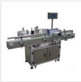
Automatic Sticker Labeling Machine