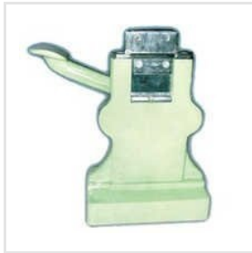
Hand Tube Crimping Machine