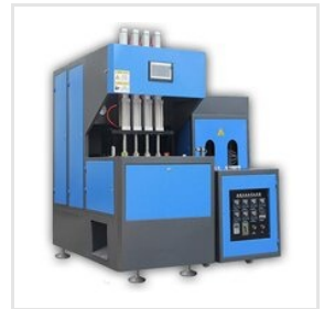
Bottle Blowing Machine